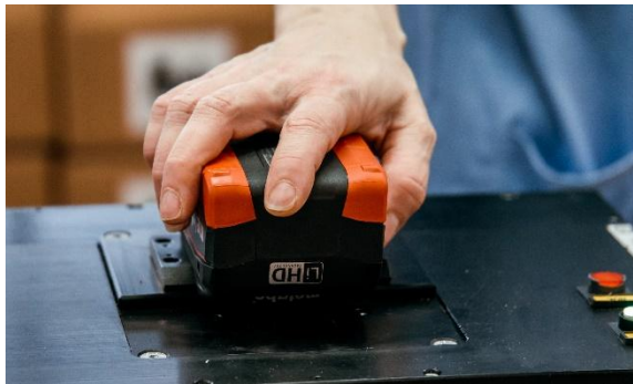
Li-ion rechargeable batteries