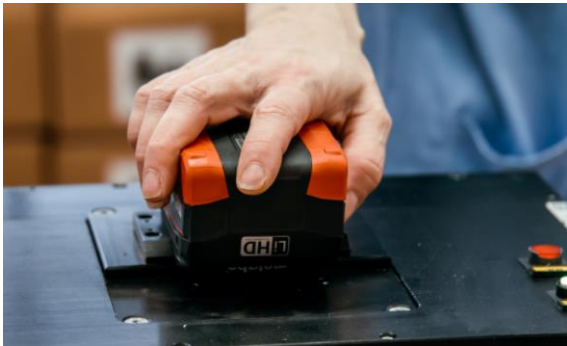
Li-ion rechargeable batteries