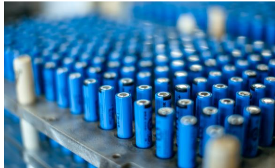
Ni-MH rechargeable batteries